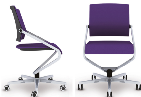
5 star polished aluminium die cast base