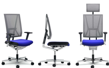
partner with scope task chairs