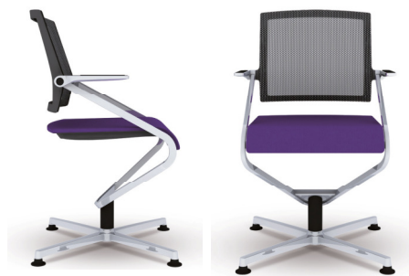
4 star polished aluminium die cast base